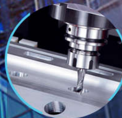
CNC MACHINING ON EXTRUSION