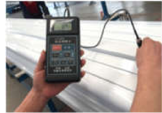
⑥Powder Color Test