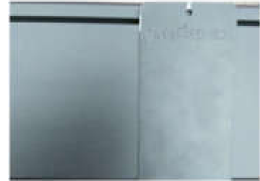
③Color Match Test